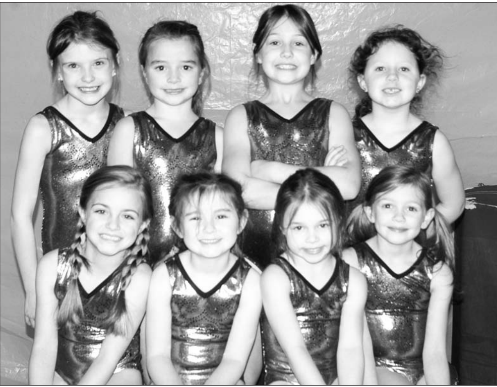
AAU Level 2