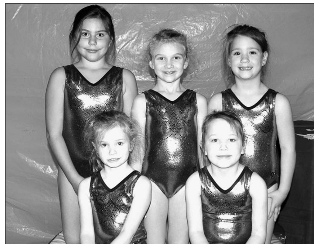
AAU Level 1