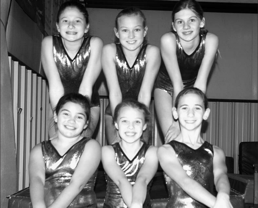
AAU Xcel Silver