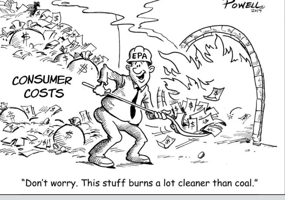
"Don't worry. This stuff burns a lot cleaner than coal."