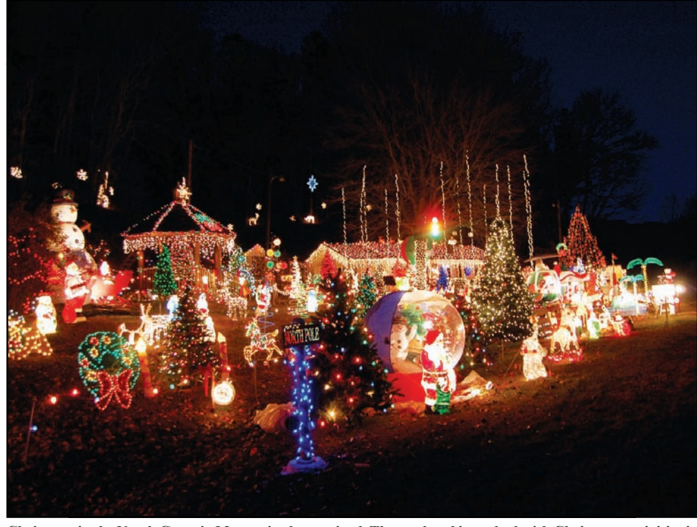
Christmas in the North Georgia Mountains has arrived. The weekend is packed with Christmas activities in Union County. Business leaders and local businesses urge shoppers to shop local.

Hoyt's had a huge sale on furniture and appliances