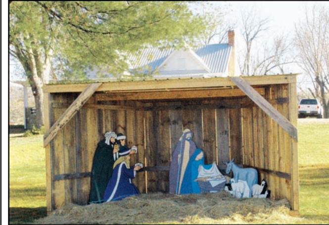
The manger scene at the Mountain Life Museum will come alive this weekend. It's all part of the annual Holiday on the Square.