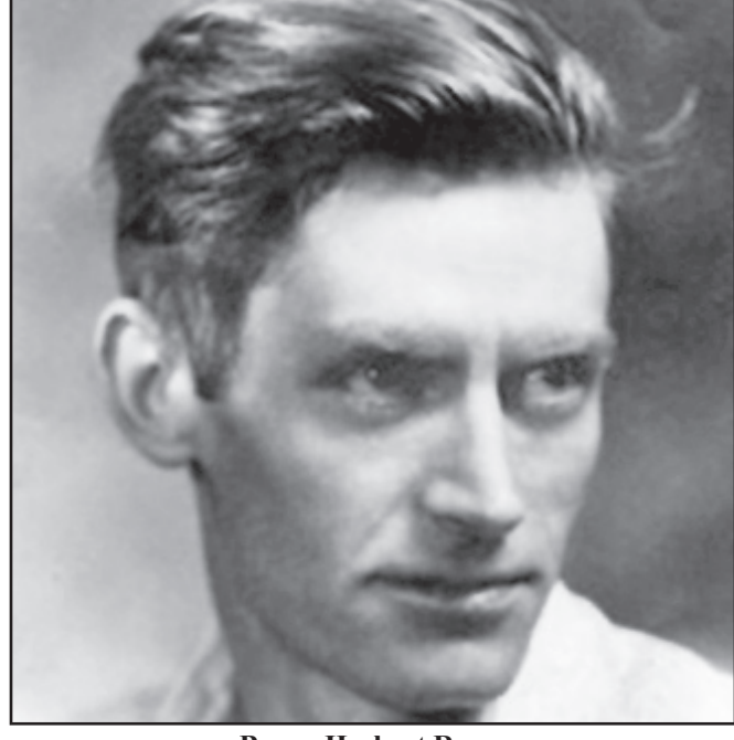
Byron Herbert Reece

The Gift and Craft Shop will feature books by and about Reece and others on subjects pertinent to Appalachia; note cards; homemade and handcrafted items including jewelry, baskets, soap, scarves, wooden bowls,