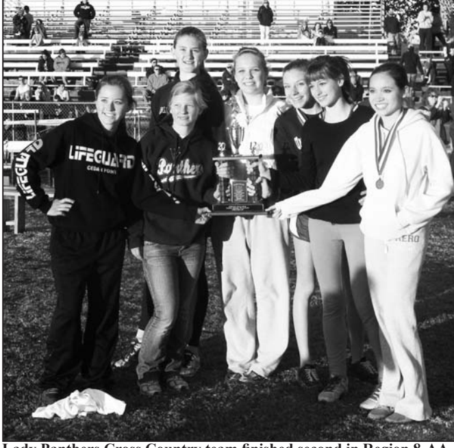
Lady Panthers Cross Country team finished second in Region 8-AA and is headed to state.

However it wasn't enough to overtake the Lady Dragons who claimed the second, third, fourth, fifth and ninth positions.