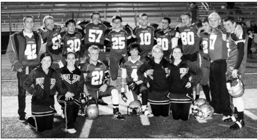
Panther senior football players and cheerleaders celebrate Senior Night.