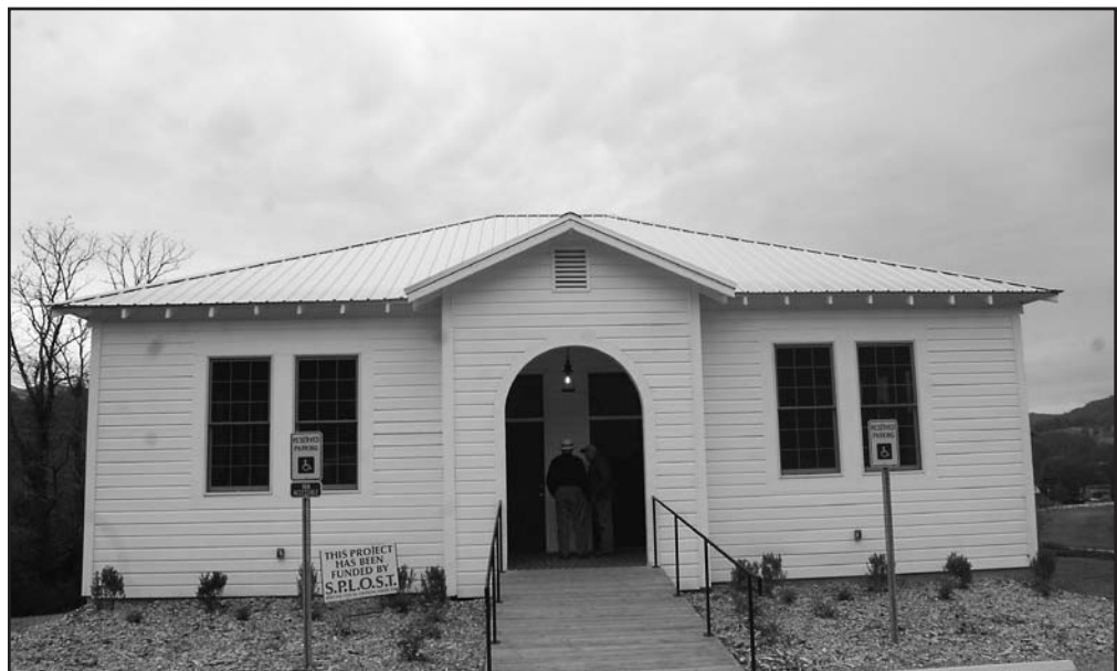
Opened in 1936 as a one-room schoolhouse, the Choestoe Community Center and Voting Precinct is now open to the public for family reunions, weddings and friendly gatherings.

"It's just an example of what SPLOST means to this community," he said.