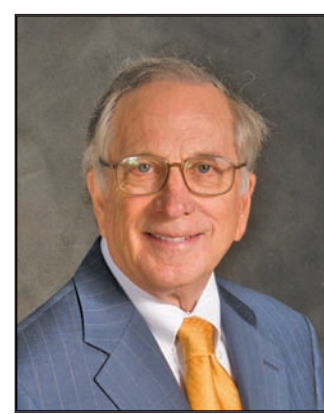
U.S. Sen. Sam Nunn

Michelle Nunn, a Democrat, is in a dead heat with Republican David Perdue for