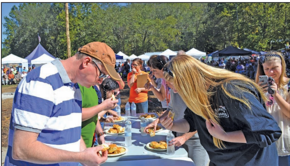
Contestants gobble down biscuits full of sorghum syrup at the 45th Annual Sorghum Festival. The festival ended on Sunday.

Once again, at 9 a.m. on Saturday and Sunday, the syrup making began and the vendors opened for the day. The toe tapping got started at 10:30 a.m. with an all star mu-