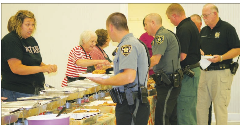
Union County and Blairsville public safety officers get a meal provided by 21st Century Church.

According to the invitation to the event, the lunch was prepared by "21st Centu-