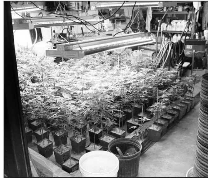
790 plants seized from Pot Bust on Mull Valley Road