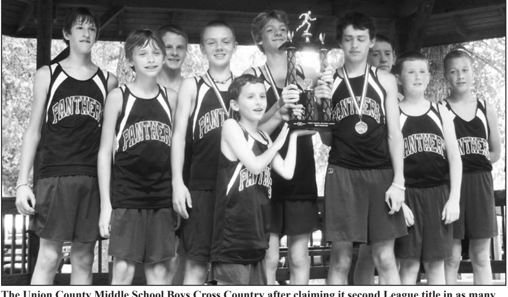
The Union County Middle School Boys Cross Country after claiming it second League title in as many years..

who will make an immediate impact on the success of the high school program," Coach