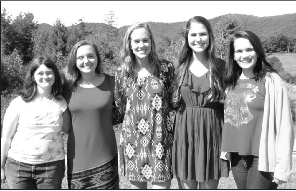
Senior Class representatives