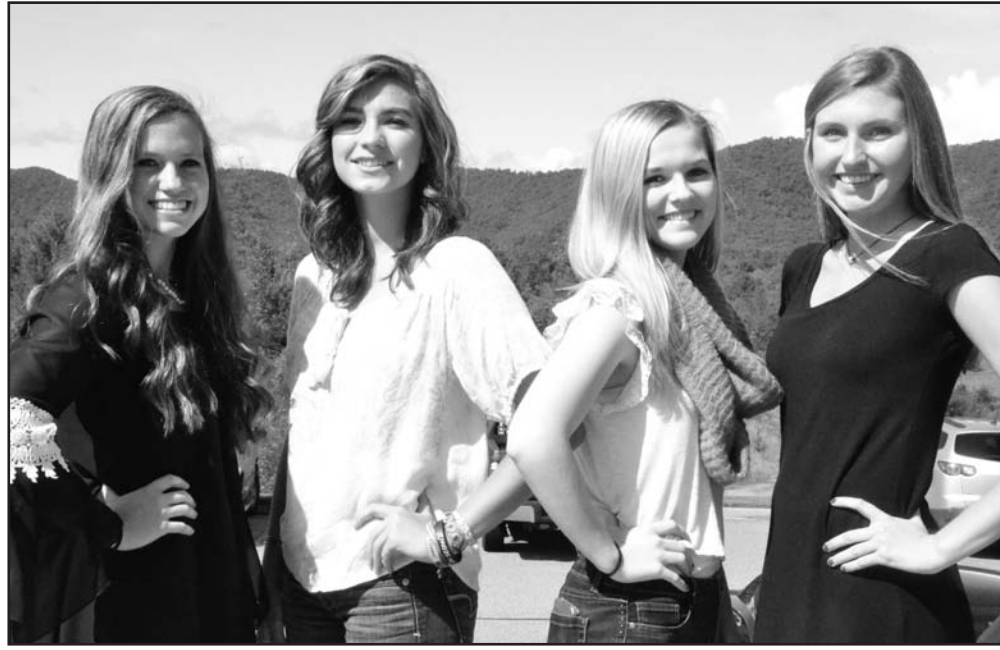
Junior Class representatives