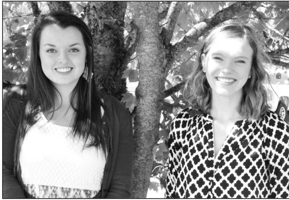
Freshman Class representatives