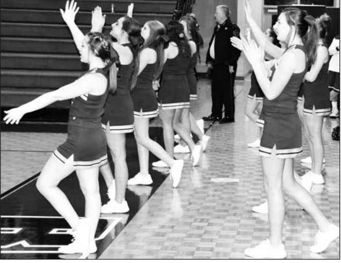
UC's cheerleaders support the teams at Fannin.