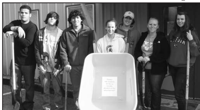
YHC students donate wheelbarrow to the Shelter.

On Sunday, December 2, 2012, members from the Blairsville Garden Club and twelve students from Young Harris College met at the Union County Humane Society Mountain Shelter to participate in a community improvement project.