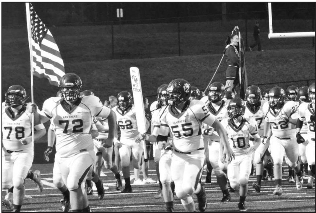
The Panthers take the field on a damp, muggy evening in Social Circle. Union overcame a sluggish start and a few mental mistakes to blow open a 7-0 game after the first quarter.

From their own 20, Mancuso was sacked for a 10-yard loss on first down