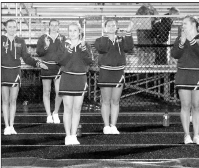
The rainy weather and damp conditions didn't deter the UCHS Cheerleading squad from making the trip.

went back to Gilbert over the middle and the senior wide out beat the corner and was able to slip past the safety for a gain of 33.