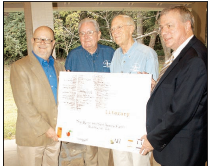
The Reece Farm joins the Southern Literary Trail.