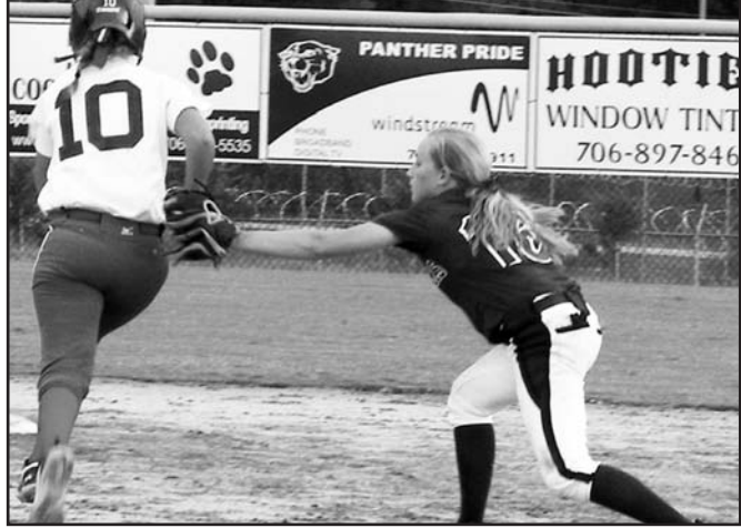
Crystal Busbee records the second out of the seventh inning against Jefferson.

Union County will resume action on Monday, Sept. 10th as they travel to Dawson County in the third and final meeting of the season between