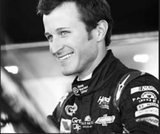
Kasey Kahne wins at Atlanta

NASCAR has announced the complete 2015 NASCAR Sprint Cup schedule. Television coverage in 2015 will be different. FOX / FoxSports1 will cover the first 16 points races of the season, plus the Sprint Unlimited, Budweiser Duel 150's, Sprint Showdown and Sprint All-Star race.