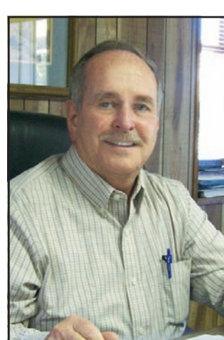
Mayor Jim Conley