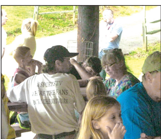
Teachers, parents, students and family gathered at the Woody Gap School for the annual Back to School Bash.

dent Council provided hot dogs and buns; while parents, faculty and community members donated delicious side dishes and desserts.