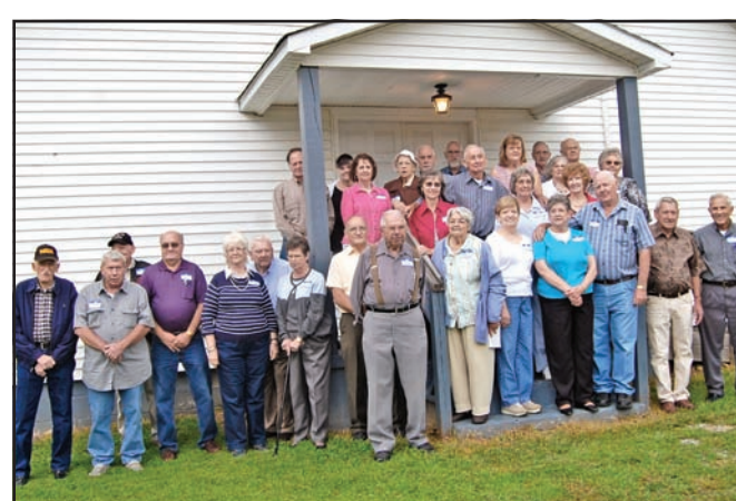
More than 50 members of the Bunker Hill School gathered Saturday for a reunion of the now defunct school on Highway 76.

The school, for students in grades 1 through 7, opened