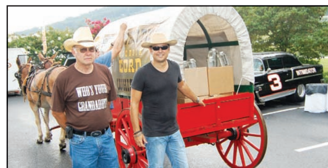
It's perfectly legal to hand out free samples. Never mind that it's moonshine.