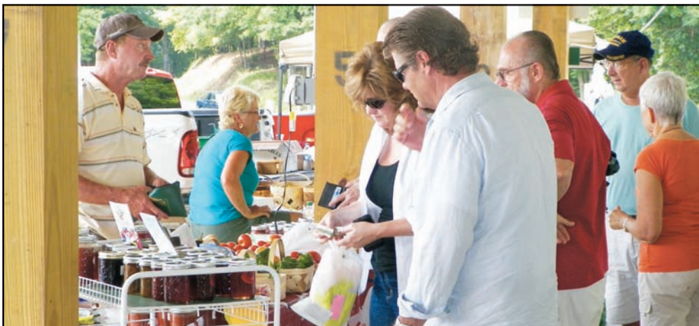
The Union County Farmers Market has been an economic shot in the arm for local farmers. The state Department of Agriculture says The Market is setting an example for rural communities in Georgia.

tors from Union, Towns and Fannin counties in Georgia as well as Clay and Cherokee