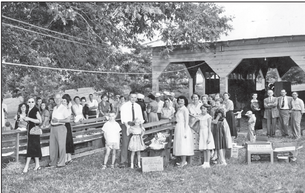
The 25th Reece Family Reunion was just the tip of the iceberg. The historic Mountain Family celebrated its 81st Family Reunion on Sunday at the House of Prayer Family Life Center off Pat Colwell Road.

the same roof on Pat Colwell Road at the 81st Annual Reece Family Reunion on Sunday.