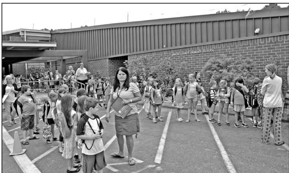
It's time to get on the school bus, the school day is over.