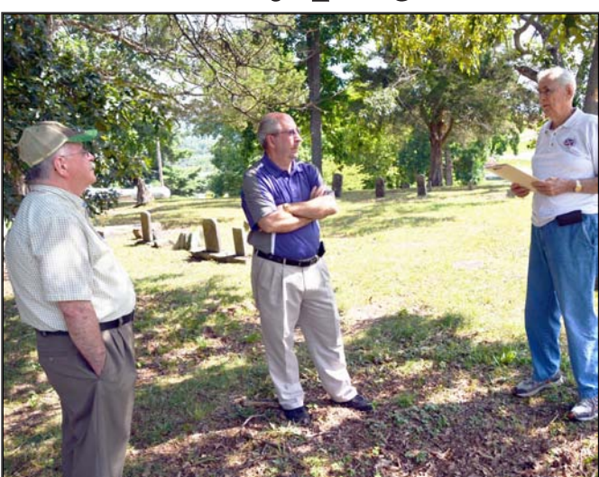
Progress continues with Old Blairsville Cemetery Project. The plan is to restore and preserve the cemetery, and enclose it with a wrought-iron