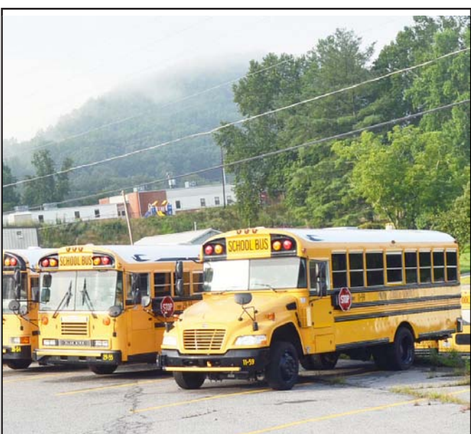
Union County school buses are ready to roll on Friday as classes resume for the 2014-2015 school year.