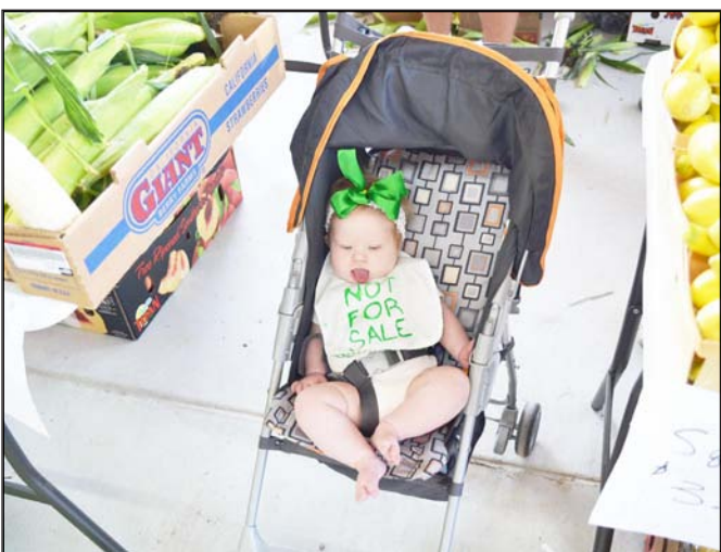
Not everything was for sale at Saturday's Fifth Annual Green Bean Festival at the Union County Farmers Market.

The Green Bean Festival was swamped with patrons, as