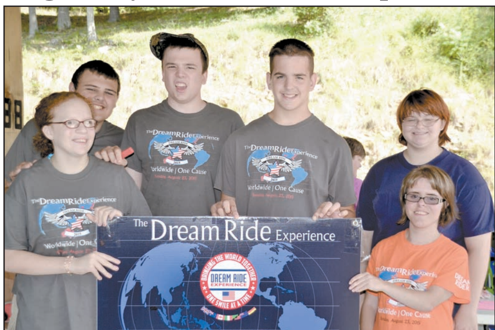
Union County Special Olympians attended the Farmers Market on Saturday, July 16, to raise awareness and funds to go toward providing a Dream Ride Experience in Connecticut

it started, there were tears flowing everywhere. It's an experience that you can't put into words. There are so many