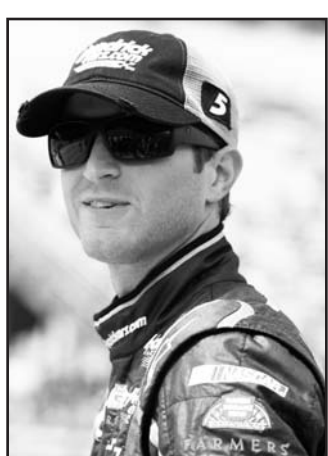
Kasey Kahne, winner at New Hampshire.

"So we don't have just an A and B sample, but an A