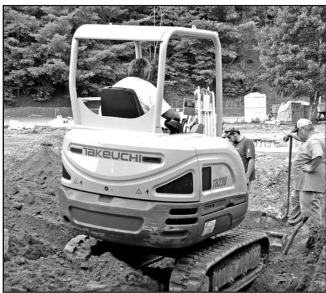
Construction is underway to build 10 new classrooms at Union County Primary School.

"There's not really much we could have done about it regardless, but they're paying