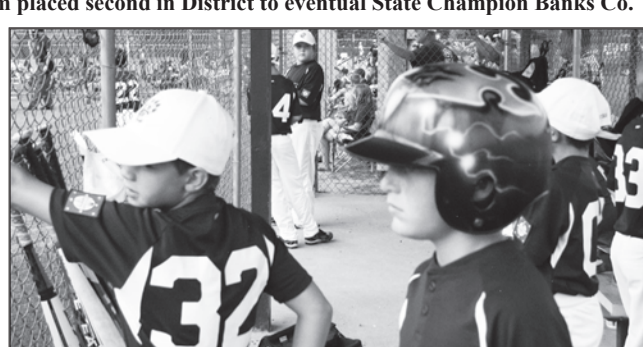
Union's 10&U team in the dugout during a win.