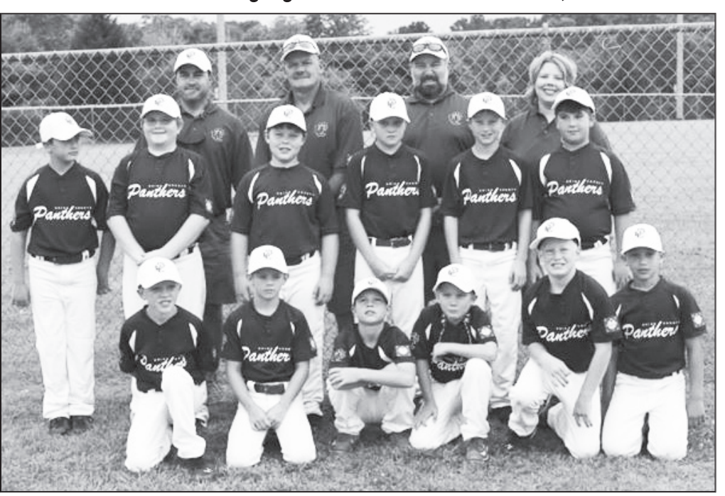
nion County's 10&U baseball team placed second at the District Tournament in Blairsville