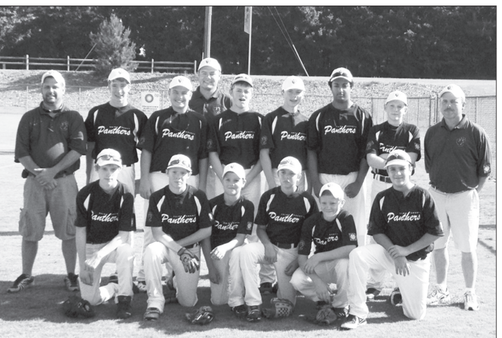
Union's 14&U baseball team won the District Tournament and is currently in the final three at State.