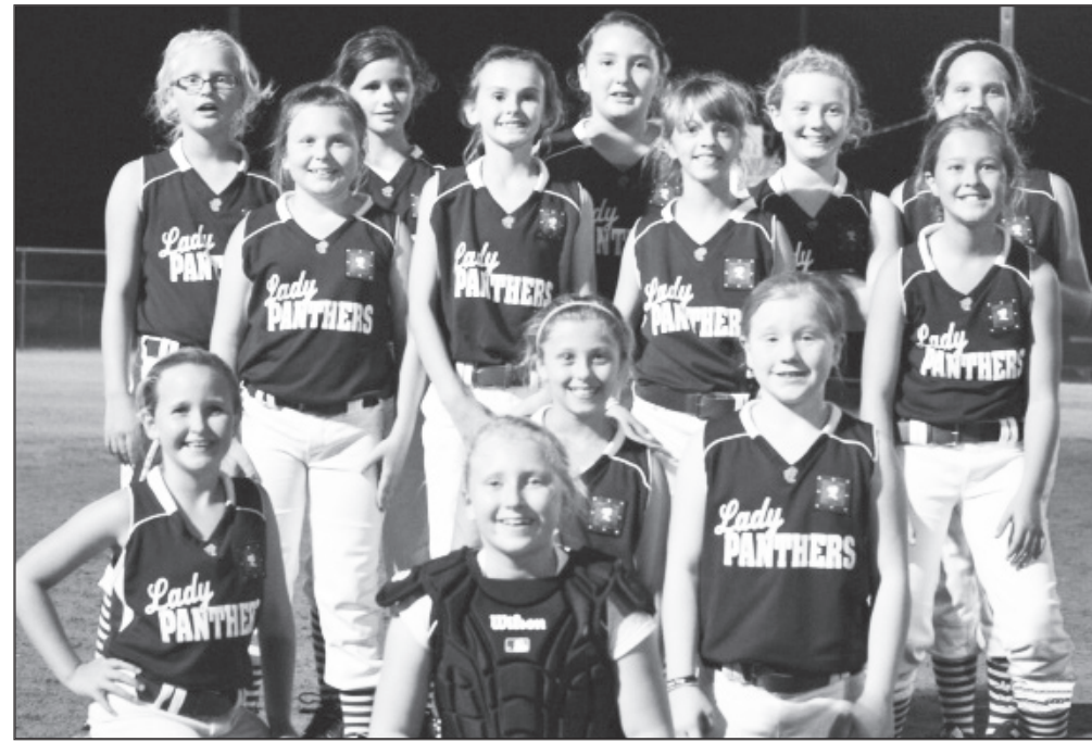
Union County's 10\&\mathrm{U} softball team placed second at district and fourth at State.