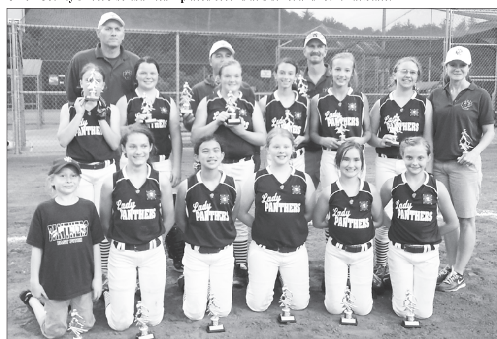
Union County's 12&U softball team placed second in District to eventual State Champion Banks C