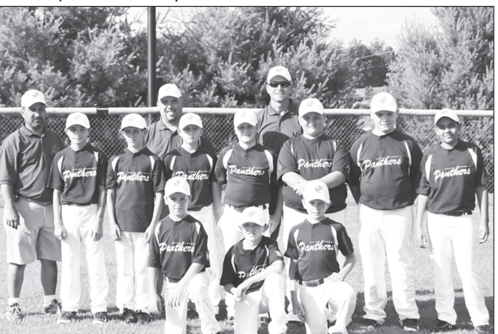
nion County's 12&U baseball team took part in the District Tournament at East Jackson Park.