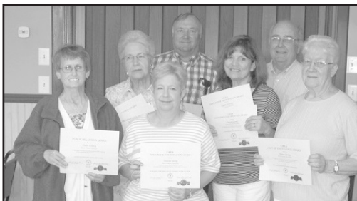
Local Awards presented at State Convention