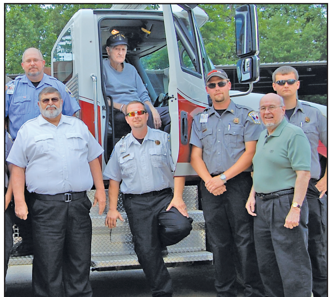
The new Fire Station 1 is open for business on Shoe Factory Road.

"We just ran out of room," Union County Fire Chief/EMA Director Charles Worden said. "We were elbow-to-elbow; we needed more space as soon as we could get it. These people come in at 8 in the morning, they go home at 8 in the morning the next day. They're here 24 hours straight. It's kind of like a home-away-from-home."