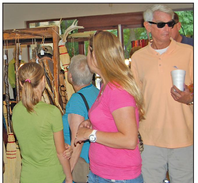
Patrons visited Mountain Fling early and often on Saturday and Sunday at North Georgia Technical College.