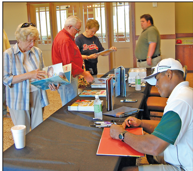
Former Brave and Falcon star Brian Jordan signs autographs at the Union County Community Center.

He was also drafted in 1989 as a NFL seventh round draft pick by the Buffalo Bills, but was cut during training camp. He was picked up by the Falcons that same year to play free safety and finished his NFL career with the Dirty Birds in 1991, as the Cardinals demanded that he forego football for a career in baseball.