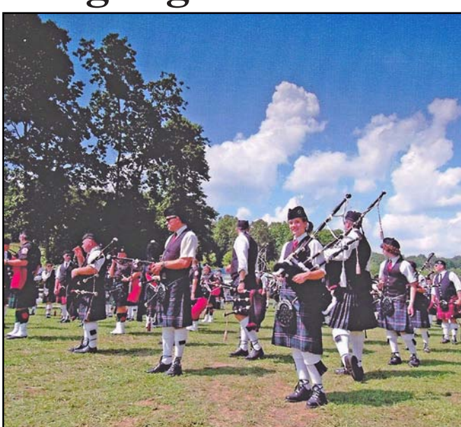
The sound of bagpipes will be heard early and often on Saturday and Sunday during the 10th Blairsville Scottish Festival.

The early settlers of Union County included many