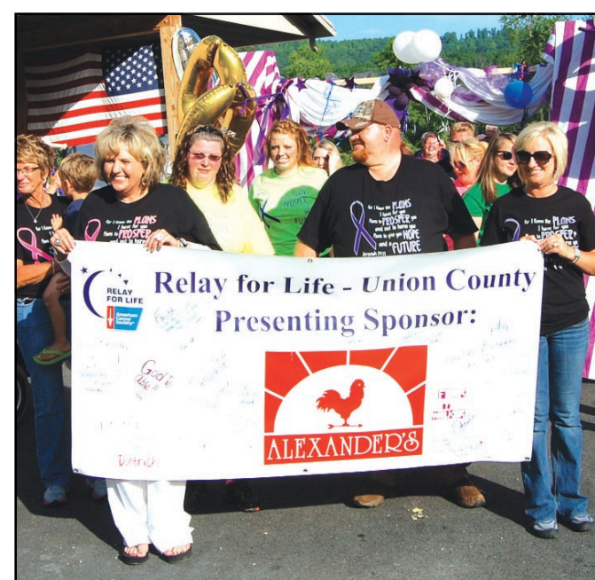
Alexander's Store claimed the Best Campsite award at the 2013 Relay For Life at Union County Farmers Market.

Alexander's Store, one of the many event sponsors, said the event touches her heart like nothing ever before.