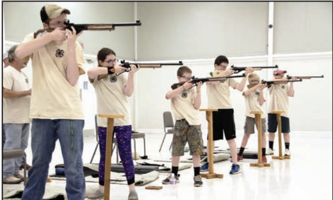
The Union County 4-H BB gun team takes aim at the Nationals in Arkansas in July. They'll be raising money this weekend with a Turkey Shoot at Stover Shooting Field.

The Union County 4-H BB Team will be holding a fund-raising event at the