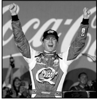
Kasey Kahne celebrates his third Coca-Cola 600 win

In a recent article in Sporting News, she said: "I'm a girl, and to say that I can't use