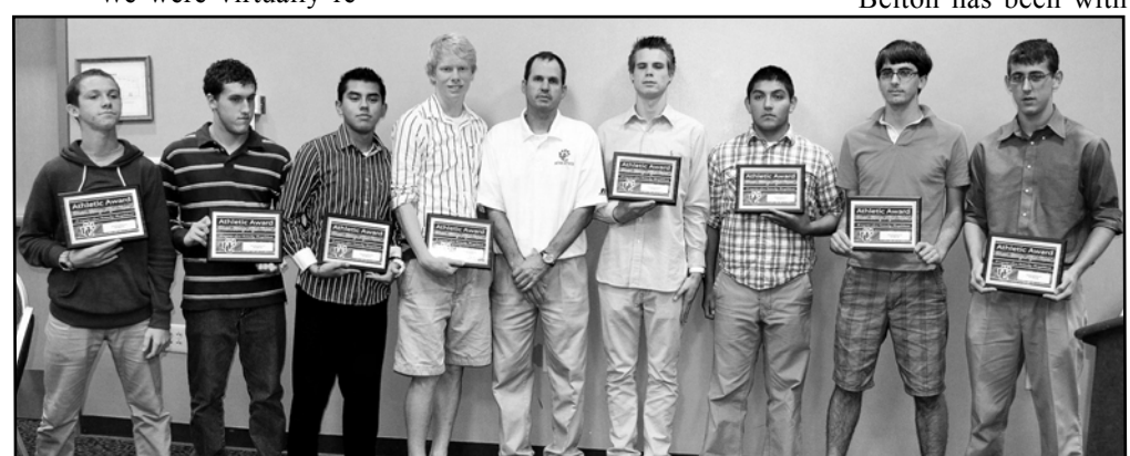
Panthers Soccer Award Winners from the 2012 Season that saw Union win six straight games in March.

"First to practice, last to leave, completely unselfish, team first, practiced harder than anyone in the off season to get better, did anything the coach asked. He is a great kid and completely deserving of