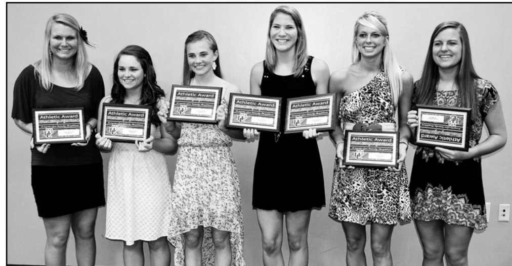
The award winners from the 2012 Union Co. Lady Panther soccer season that finished 11-3.

"She played as a defender for the first time last season