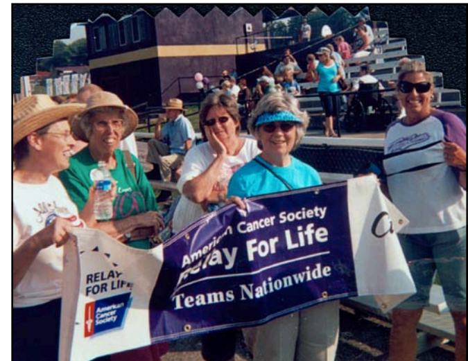
Union County's Relay For Life is set for Friday at Union County Farmers Market.