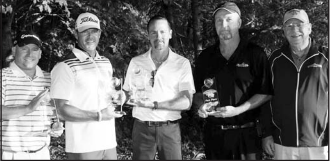
Afternoon First Flight First Place