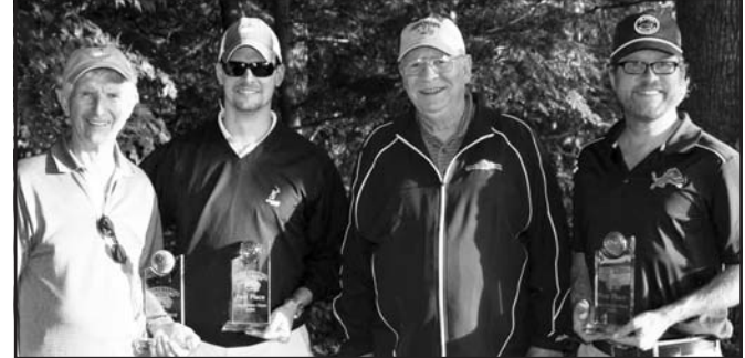
Afternoon Second Flight First Place