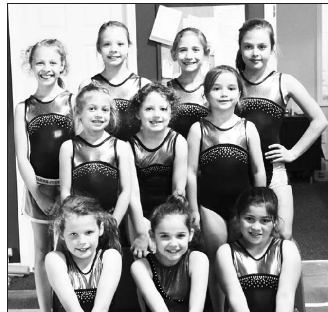
The Mountain Gymnastics Center's '34 Club.' Each of these girls recorded an overall score between 34.00 and 34.95 during the season.