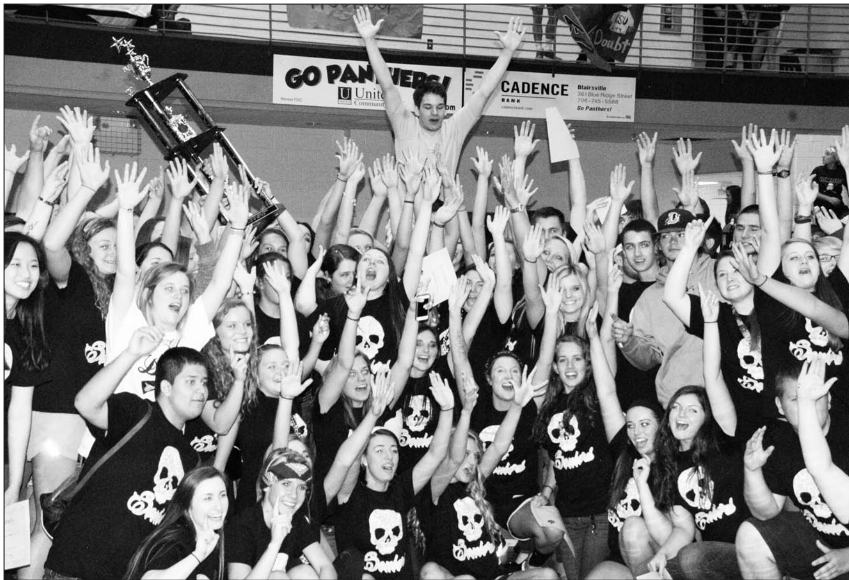
As juniors, the Class of 2014 showed no respect to their elders when they swiped the U-lympics trophy away from the seniors. Last week, the U-lympics culminated with the Class of 2014 refusing to suffer the same fate as last year's seniors and showed the youngsters who's boss, taking back-to-back U-lympics crowns.