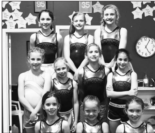
The Mountain Gymnastics Center's '35 Club.' Each of these girls recorded an overall score between 35.00 and 35.95 during the season.