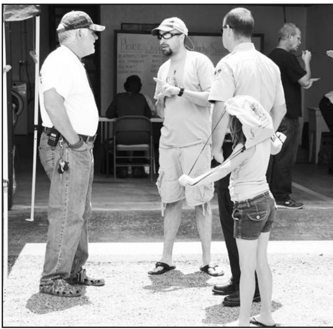
Firefighters and community members gathered at Station 2 on Saturday to share details about the station and to break bread.

"When you're here in person, you see all the trucks, you see all the equipment," he said. "It's an opportunity to sit down with folks and educate them about our operations."