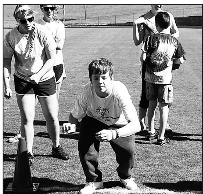
Union County Athletes participated in many events during the Special Olympics, including the standing long jump.

A special thank you was also extended to announcers,