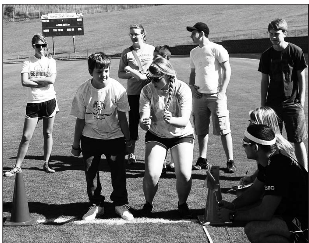
Supporters encourage a Union County athlete during last week's Towns/Union Special Olympics at Towns County High School.