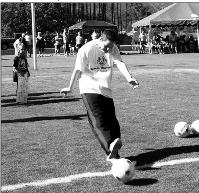
A Union County athlete participates in the soccer event during last week's Special Olympics at Towns Co. High School.