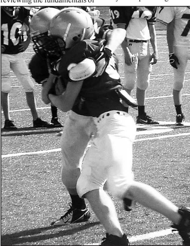
Union County football players practice tackling drills during spring practice.