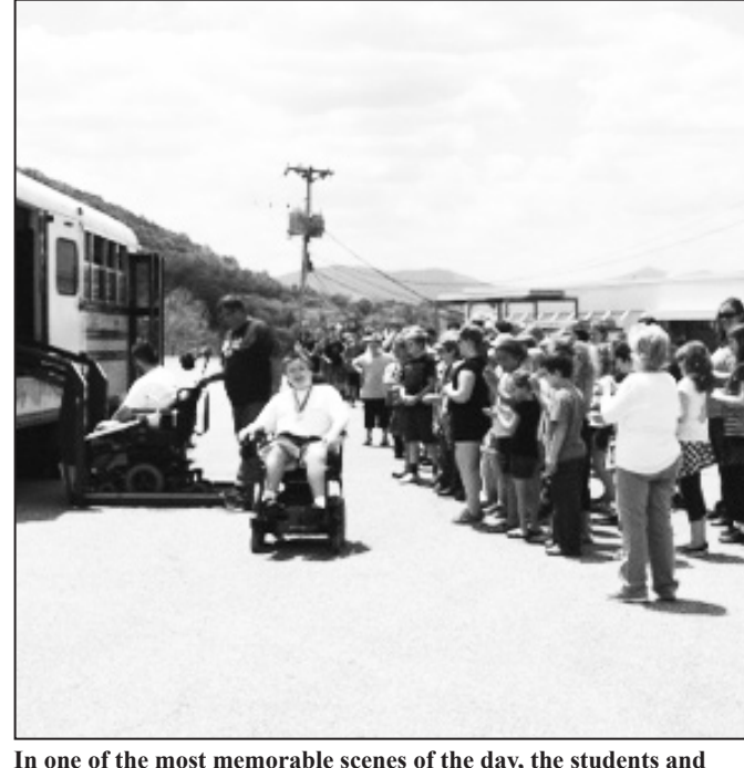
In one of the most memorable scenes of the day, the students and faculty at Union County Elementary School welcome back the Union County's athletes with cheers and lots of high-fives.

cleared and the dust has settled, all competitors are to be commended. The Special Olympics motto says it all. "Let me win. But if I cannot win, let me be brave in the attempt"