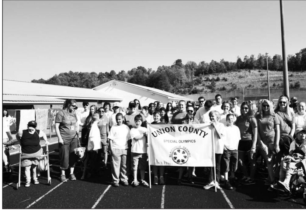
Union County's Special Olympic athletes circle the track at Towns County High School during the 2013-14 Spring Games.

The athletes were entertained before the events began by Jimmy the clown. He had everyone laughing all the way to their event.