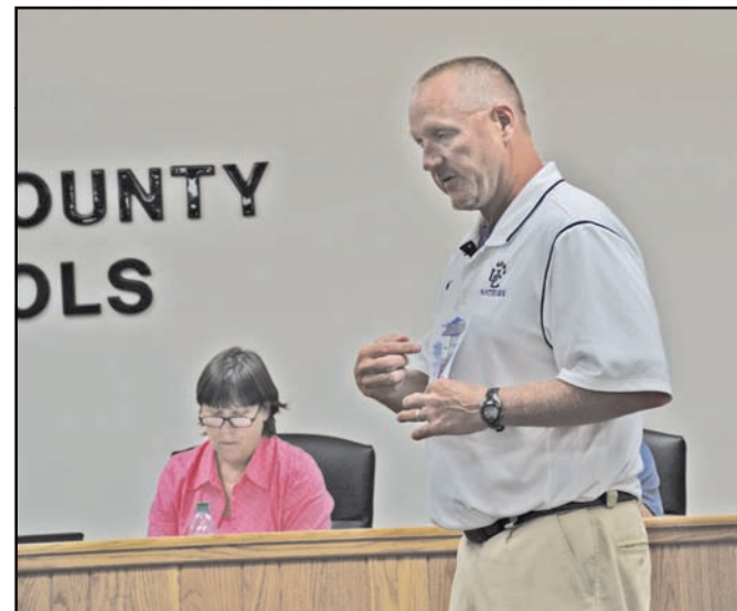
Panthers Head Football Coach shows off a digital scoreboard of the Panther field's 21st century scoreboard. Coca Cola paid $15,000 on the project, the Union County Quarterback Club picked up $20,000.

The scoreboard was paid for by $15,000 from Coca Cola, and $20,000 from the Union County Quarterback Club. The scoreboard