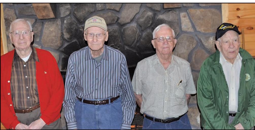
Four CCC Boys returned to Union County and Vogel State Park on Saturday for the annual CCC Boys Reunion. Almost 100 people attended the event.