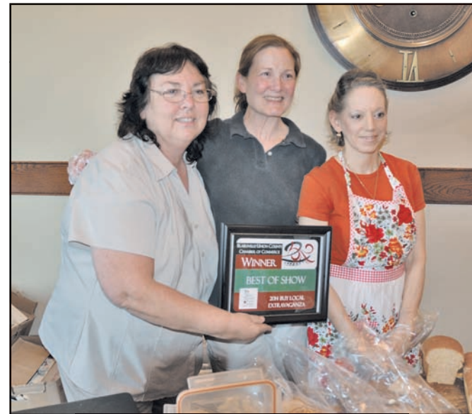
Logan Turnpike Tuesday took Best in Show at the annual Buy Local Extravaganza on Tuesday at the Union County Community Center.

Indeed, the Union County Community Center