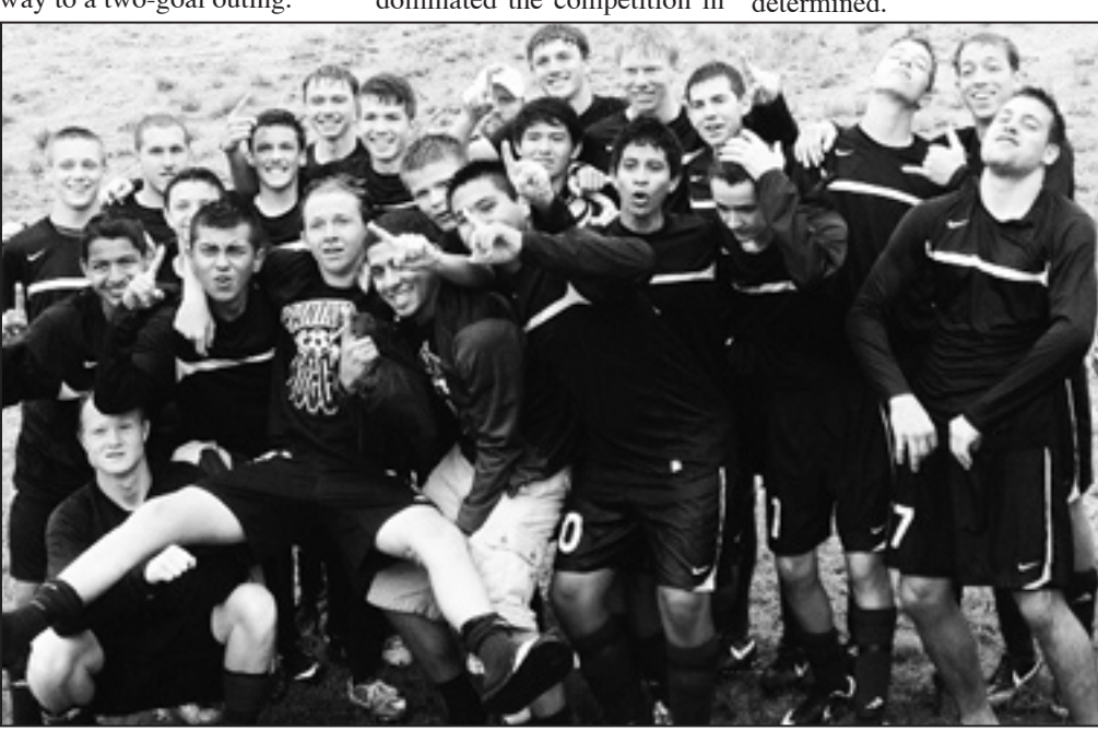
A wet and muddy Union County Panther soccer team celebrates after their opening round victory at Chattahoochee County on Friday evening.

Kickoff is set for Tuesday at 5:30 p.m. in Norcross.