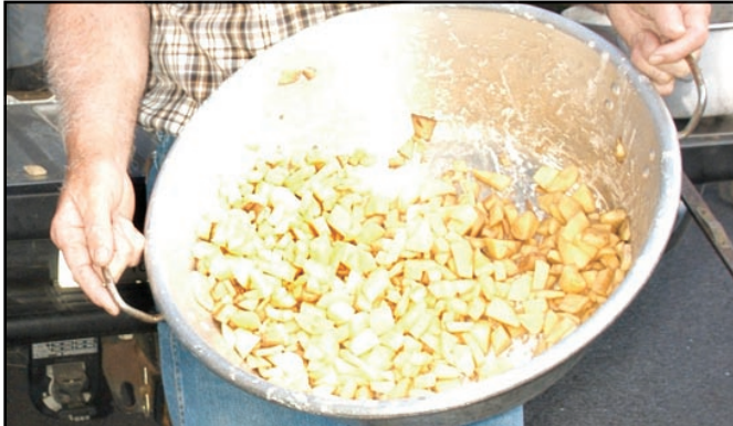
The smell stays with you for a while.

The patrons quickly learned if you take a bite of a ramp, cooked, or uncooked, you'd know it pretty quick.