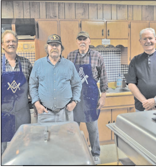
The Brothers at Allegheny Lodge #114 in Blairsville spent Saturday cooking, serving and cleaning during the Annual Big Country Breakfast.