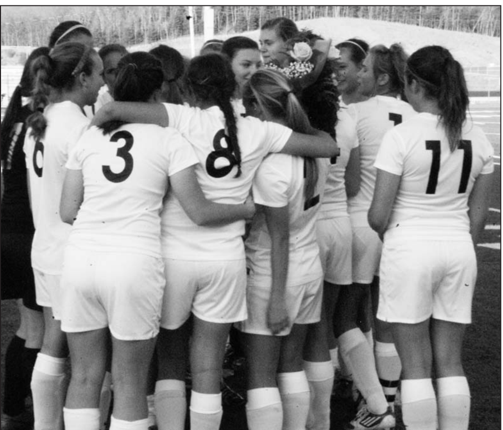
The Lady Panther soccer players embrace following the Senior Night ceremony between games last Friday at Mike Colwell Memorial Stadium.