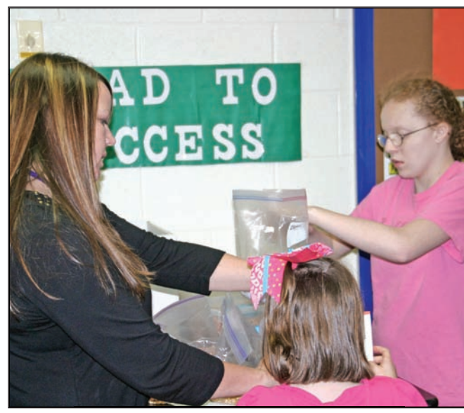
Students take part in PAES Lab assignments during last week's Open House at Union County High School.

"What it does is it allows students with various needs to work in a simulated work environment so that