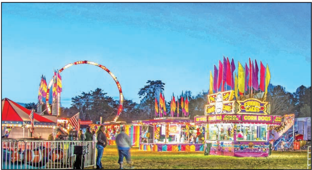
The colorful and musical Midway at Blairsville Kiwanis Mountain Fair on Airport Industrial Road.

a week of exciting rides, delicious food and fun games, providing one of the most exciting adventures this county has ever experienced.