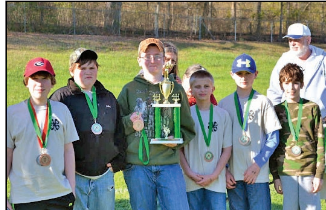
North Georgia News News Special

The Union County 4-H BB Gun Team is headed to the State Match.