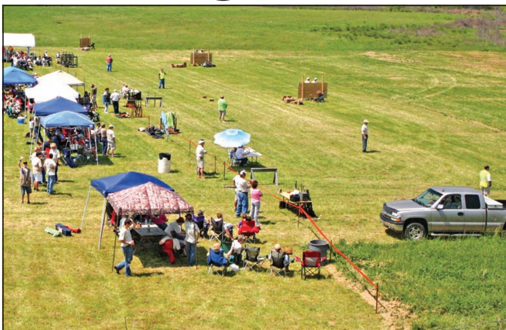
Union County has served as home of the District 4-H shooting tournaments over the last several years. Soon, the team will have a true homefield advantage at a 9,502-acre site off Georgia 515.