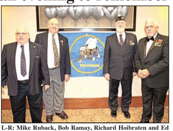
Crenshaw were the driving force behind Blairsville's first ever Seabee Ball Navy came all the way from the exceptionally supportive

Seabees from around the region attended the event, along with individuals from other branches of the U.S. Armed Forces, highlighting