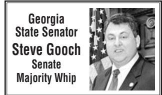
Georgia State Senator Steve Gooch Senate Majority Whip

I presented two bills for a Senate floor vote last week—Senate Bill 316 and Senate Bill 366. The first bill lifts the daily cash or gift prize limit of $1,500 on bingo games, but keeps the weekly prize limit of $3,000. This legislation benefits charities and local organizations that run bingo games as fund raisers. The second bill, Senate Bill 366, allows the Georgia Department of Transportation to use an alternative process for selecting and contracting project services based on the lowest priced proposal. This will ensure efficiency in both project cost and contract