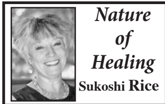
Nature of Healing Sukoshi Rice