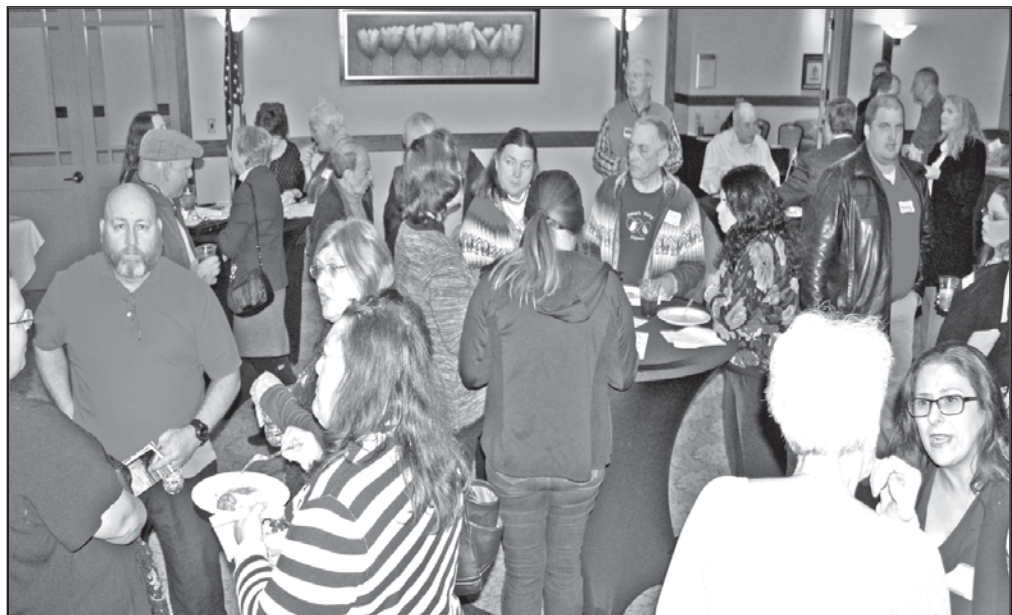
Chamber members socialize at the First Quarter 2016 Business After Hours at the Union County Community Center.