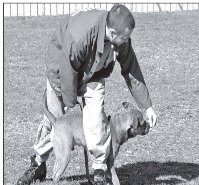
CPDC detainee working his dog