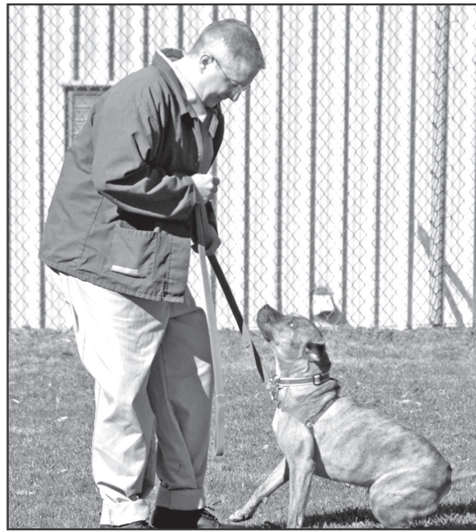
CPDC detainee showing off what his dog has learned